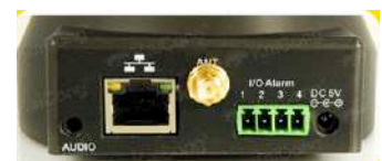
Non-Poe camera DC connector options - see other listings for each type.